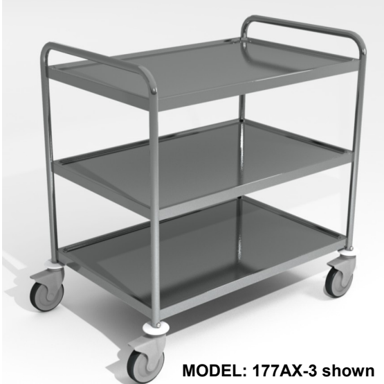
MODEL: 177AX-3 shown